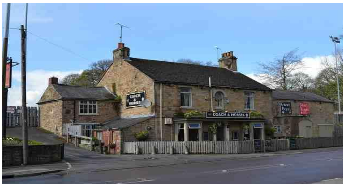
The club house and ground hoppers yearly meeting place (Burp!)

From the south go via Chesterfield Railway Station walk a few minutes to Holywell Road Stop V and take the Stagecoach Yorkshire Che 43 to the Coach and Horses pub.