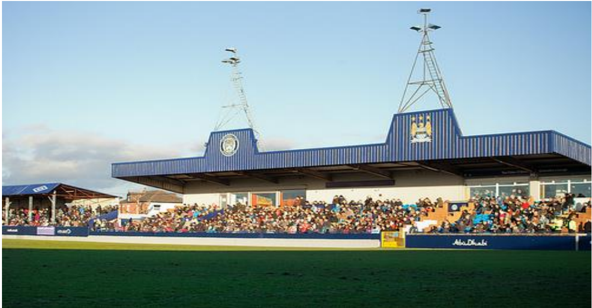
Main Stand and Scratching Shed

Year Ground Opened: 1885 (Bankfield Fields FC)