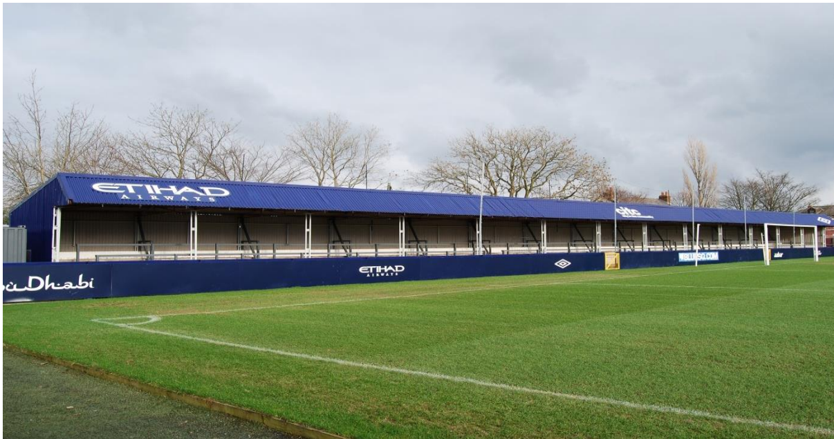
Tinkers Passage End

Travel down the M1/A1 to Junction 42 take the M62 to Manchester & Bradford then at junction 20, take the A627 (M) exit to Rochdale/Oldham, at the roundabout, and take the 1st exit onto A627 (M) heading to Oldham and Continue onto Broadway/A663. After two miles slight left to merge onto M60 toward Ring Rd (E & S)/Ashton-u-Lyne/ Sheffield/ Manchester Airport/ M67/M56 then at junction 24, take the A57/M67 exit to Denton/Hyde/Sheffield Leave the M67 at Junction 3 and at the traffic lights at the top of the sliproad then turn right towards Hyde Town Centre.